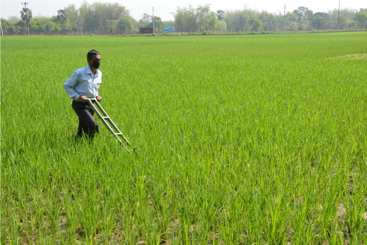
Doing inter-cultural operations in the paddy field.